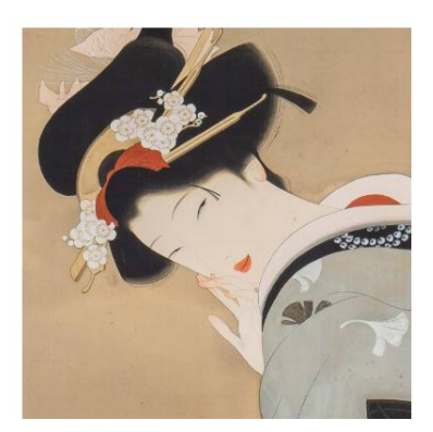
Oda Tomiya "Autumn Evening"