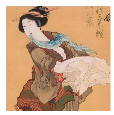
Katsushika Hokusai "Beautiful Woman with Kinuta"

East and Shōen of the West" form the core of the exhibition. Kaburaki Kiyokata and Uemura Shōen, each with their own conception of female beauty and contrasting techniques, were two of the major bijin-ga artists of the 20th century. Their paintings are supplemented by the different notions and techniques of Itō Shōha, Itō Shinsui, and other masters, as well as expressions of beguiling beauty by artists such as Kainoshō Tadaoto and Okamoto Shinsō. Before each work, you may hear an inner voice murmuring "You're beautiful." Which one will make you say it out loud?