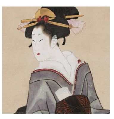
Utagawa Kuninaga "Standing Figure of a Girl about Town"