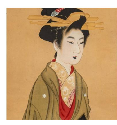
Gion Seitoku "Standing Beauty"