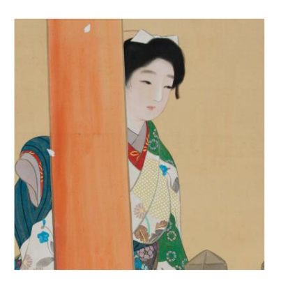
Ikeda Shōen "Spring Day"