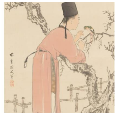
“Duke under the pomegranate tree”