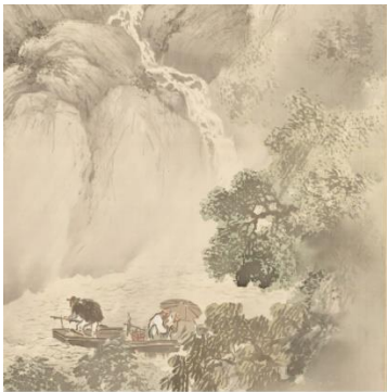
“Rain on the river”