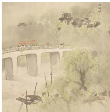
“Spring haze at willow bank”