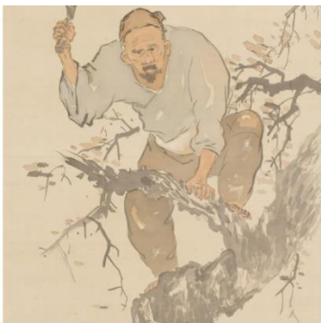
“Lumberjack in frosty forest”