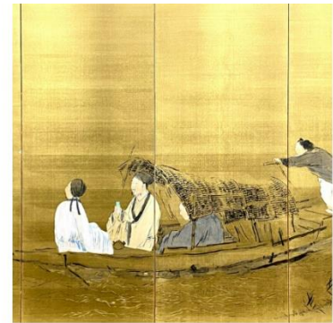
“In front of Red Cliff”

*Above works belong to HAKUSASONO HASHIMOTO KANSETSU GARDEN & MUSEUM KYOTO.