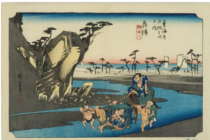
“Okitsu – the Okitsu River”

from Fifty-three Stations on the Tōkaidō’53 stations from Tokaido by Uragawa Hiroshige (197-1858)