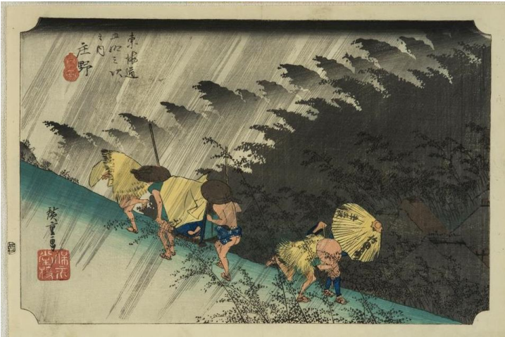
“Rain Shower at Shōno”

from Fifty-three Stations on the Tōkaidō’53 stations from Tokaido by Uragawa Hiroshige (197-1858)