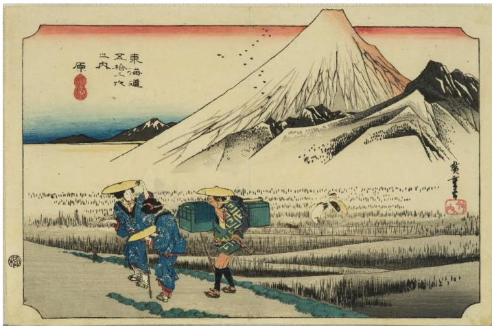
“Hara – Morning View of Mount Fuji”

from Fifty-three Stations on the Tōkaidō’53 stations from Tokaido by Uragawa Hiroshige (197-1858)